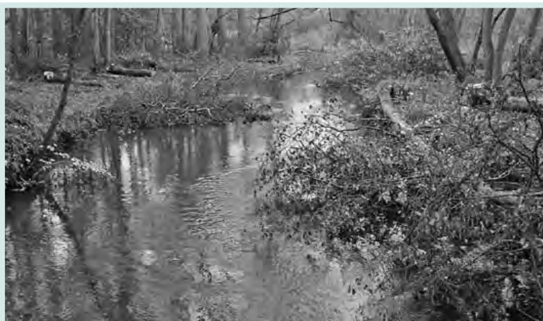
Installing woody debris on the River Bure – before.....and after

The winner in the Amateur Category was the partnership project of the Blickling Fishing Club and the National Trust , who clearly relished a difficult challenge by attempting to re-instate woody debris in a North Norfolk river – in this particular case, the River Bure upstream of Blickling Mill . Historically, river authorities and the club had always removed fallen trees from the river channel. Both channel morphology and fish populations have demonstrably improved, and some interesting and very comprehensive invertebrate, fish and geomorphological studies are being carried out in relation to evaluating the effects of the increasingly popular habitat improvement technique of installing large woody debris in the river channel.