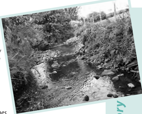
Different approaches to narrowing on the River Kennet