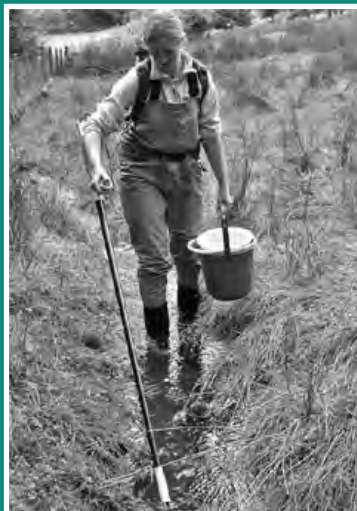
Electrofishing survey on a beck near Grisedale, in the Eden catchmen

and the detailed scientific approach to determining which factors and drivers are the most important ones to be addressed, i.e. where do you direct your effort and get most 'bangs for your bucks'?