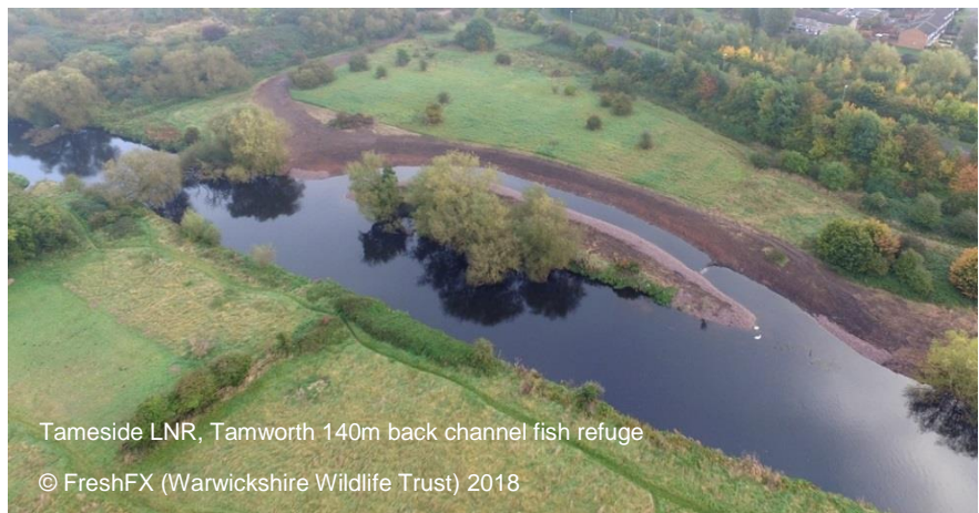
Tameside LNR, Tamworth 140m back channel fish refuge