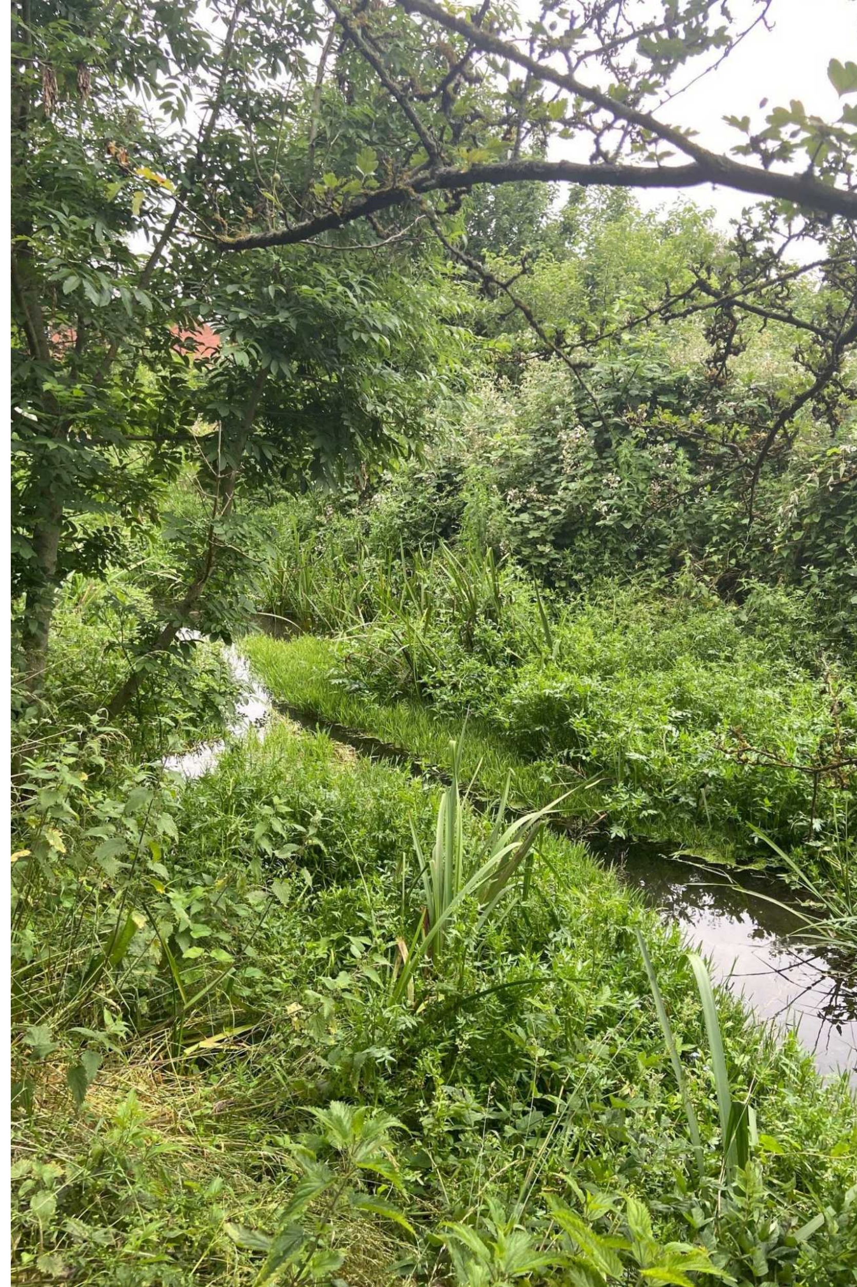
↑ Nuns Walk Stream Restoration, Winchester,

Our team is led by highly experienced engineers, ecologists and project managers, bringing knowledge and experience from both industry and academic research.