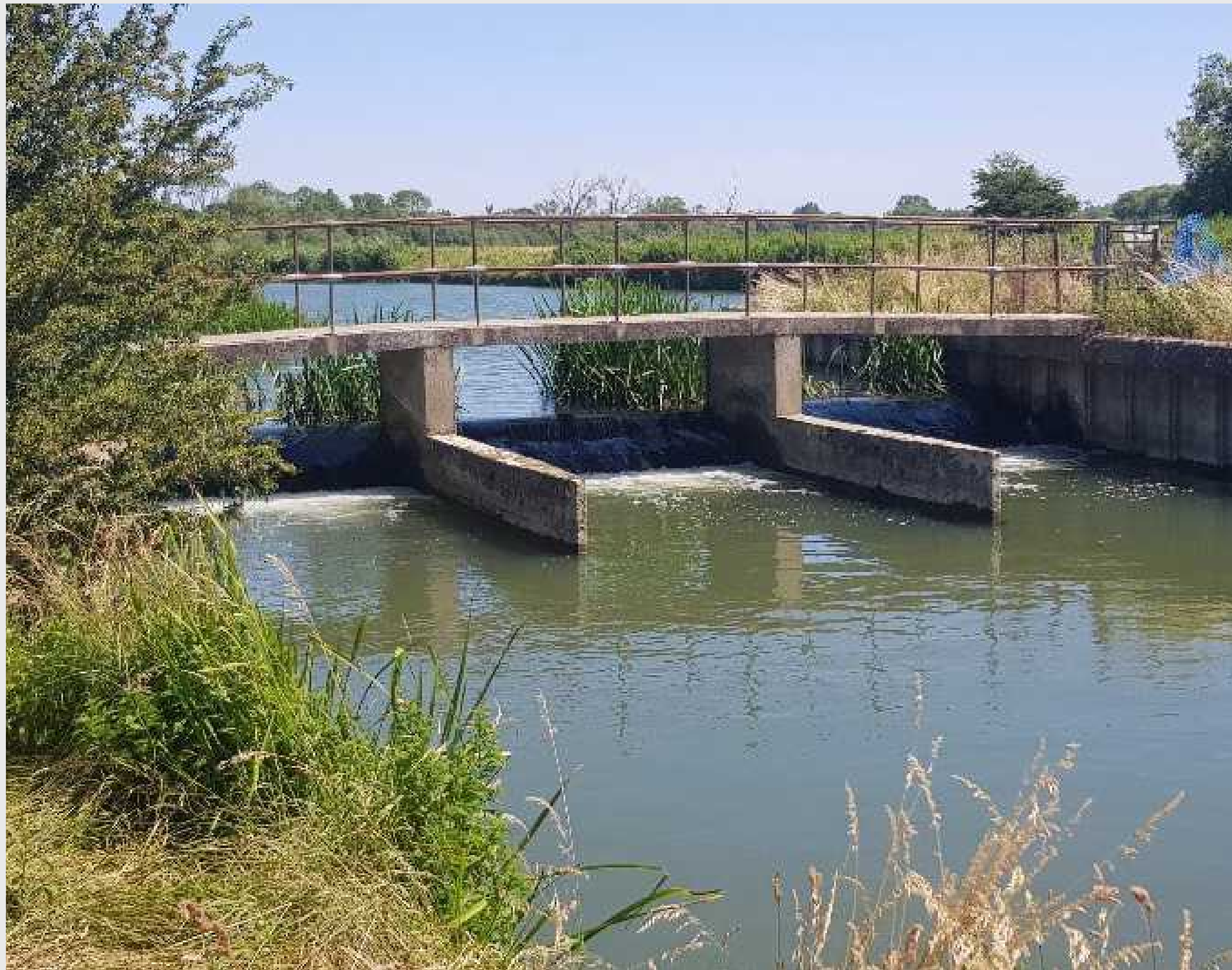
↑ Seacourt Stream Offtake from River Thames Barrier to Fish Movement

CLIENT: Thames Water and The Environment Agency