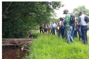
View More photos >>