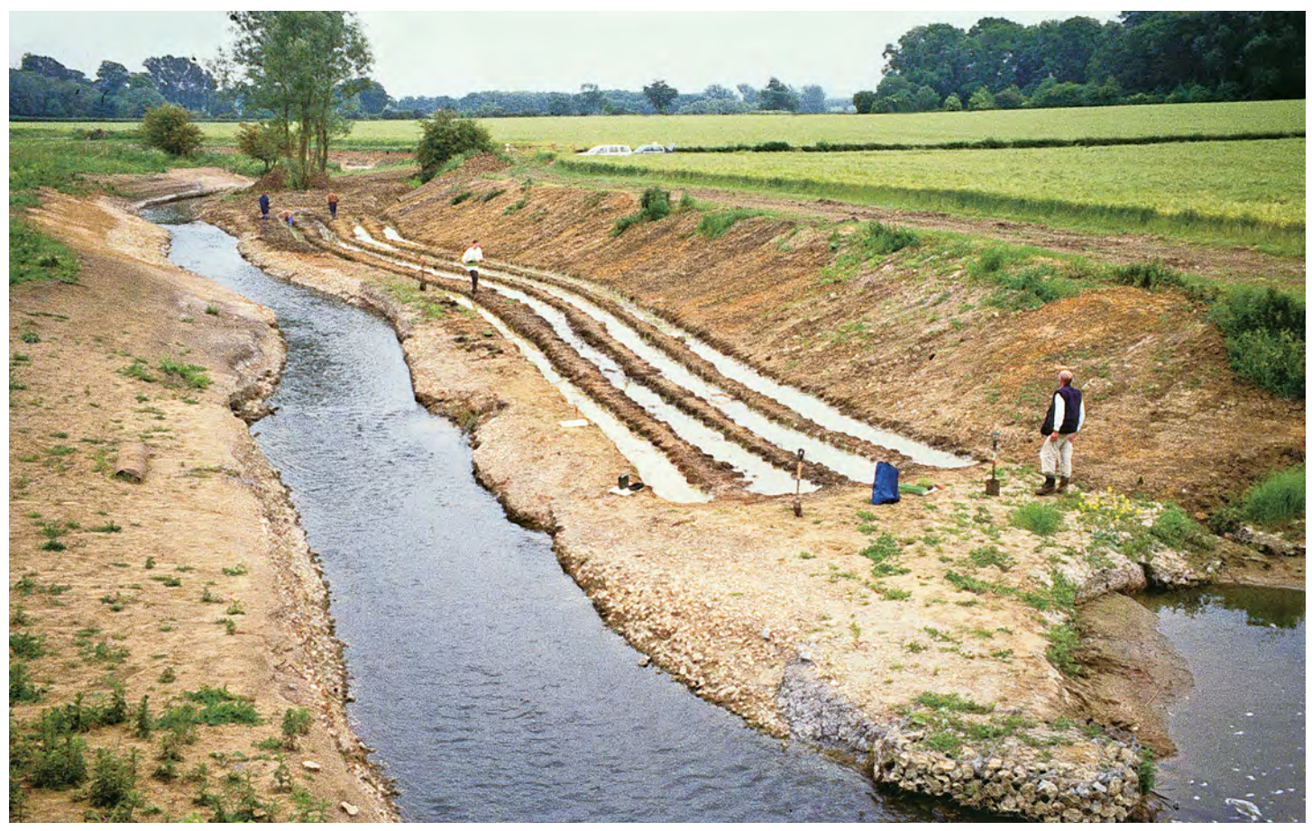
Planting reedbed – Spring 1996

RIVER COLE Location – Coleshill, Oxon/Wilts border, SU234935 Date of construction – Autumn 1995 – Spring 1996 Area – 640m<sup>2</sup> Cost – £500