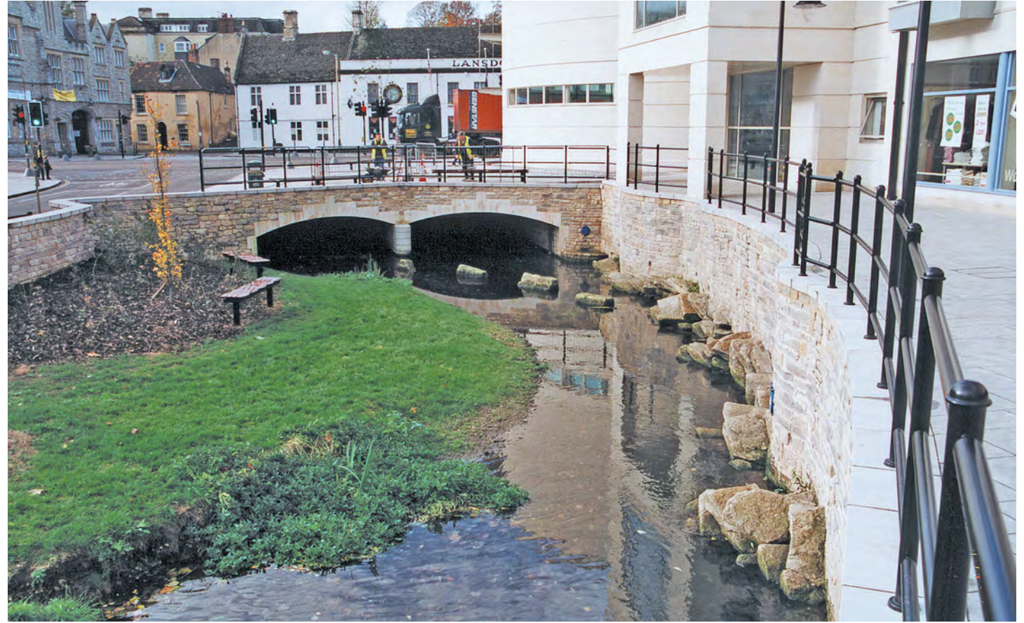
Seating and gentle grass and gravel slope to water's edge