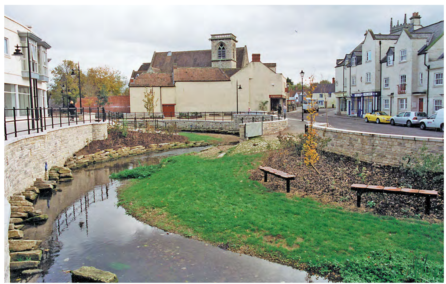
View showing the lower part of the accessible new river course

The inner bend that fronts the retail development is shown as a cross-section in Figure 8.5.2 . Three wide steps surfaced in slabs of Purbeck limestone form the riverbank. These 'stepped platforms', as they have come to be called, are up to 1.5m wide and provide informal seating areas for people at the riverside. The steps give direct access to the shoal and are integrated into the parade that fronts the new retail area.