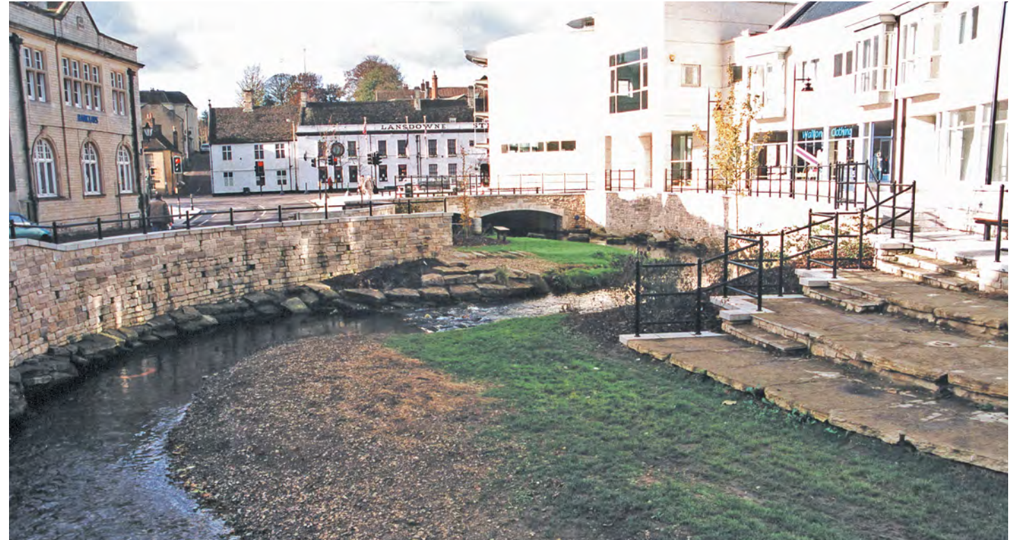
Stone steps leading down to grass and gravel shoal