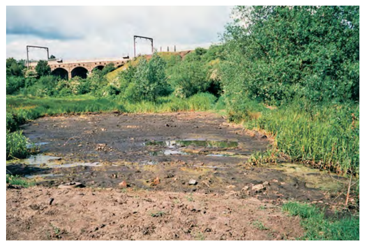
View of Rockwell scrape site after removal of rubble piles

Comparitive view of Rockwell scrape after work completed