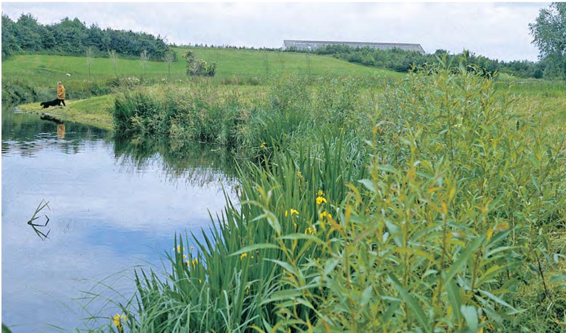
Willow spiling 2 years after construction