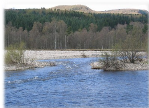
River Tummel

The aim of the workshop was to discuss current thinking about best practice fish passage; the impact of barriers to sediment, fish and flow; and how to improve morphology. The key findings will be reported in a workshop report and the RRC would like to thank everyone who attended or contributed to either day.