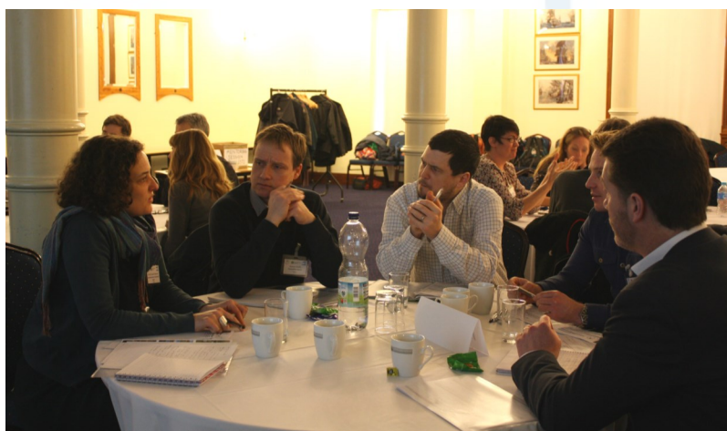
Group discussion at the Bristol event

Watch out for future RRC training courses via our events stream >>>