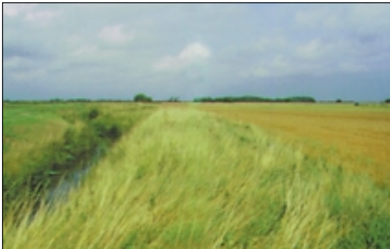
View along the trapezoidal right bank of the Long Eau