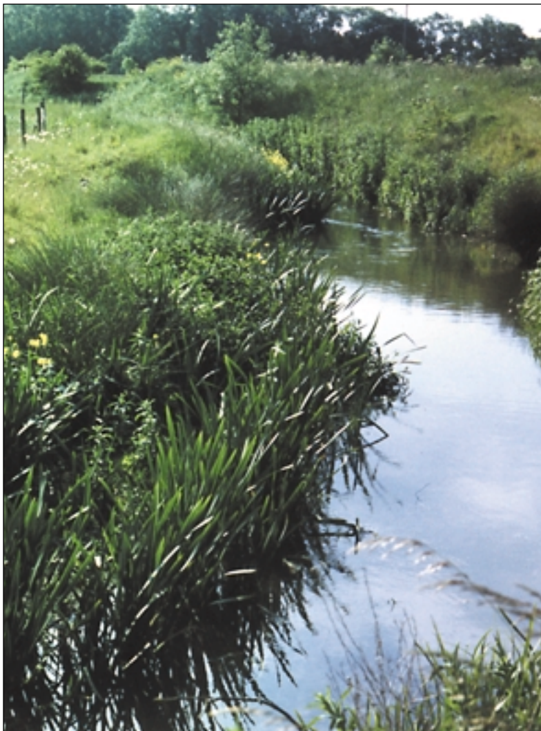
Berm at section A after 4 years