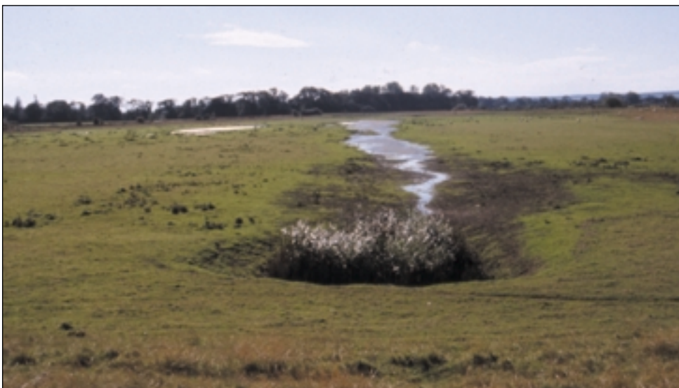
Floodplain, penstock and permanent wetland area, October 2001

Water will spill onto the site from the Long Eau when levels reach 2.6m above OD and has reached a maximum of 4m above OD. Levels are then reliant on conditions in the Eau subsiding and, depending on the intensity of the event, have been retained for two or three days. Below the Eau level of 2.6m, 75% of the washland will retain water to a depth of up to about 0.5m. This can remain for 3-4 months providing ideal conditions over the winter months for dabbling and grazing ducks such as widgeon, teal, gadwall and mallard.