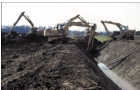
Relocating the IDB drain and set-back floodbank

Landowner support was key to the implementation of the schemes, and some form of financial mitigation was essential to landowner support. FWAG and the Countryside Commission helped landowners successfully enter into the Countryside Stewardship Scheme, to gain compensatory funding of a total of £60,000.