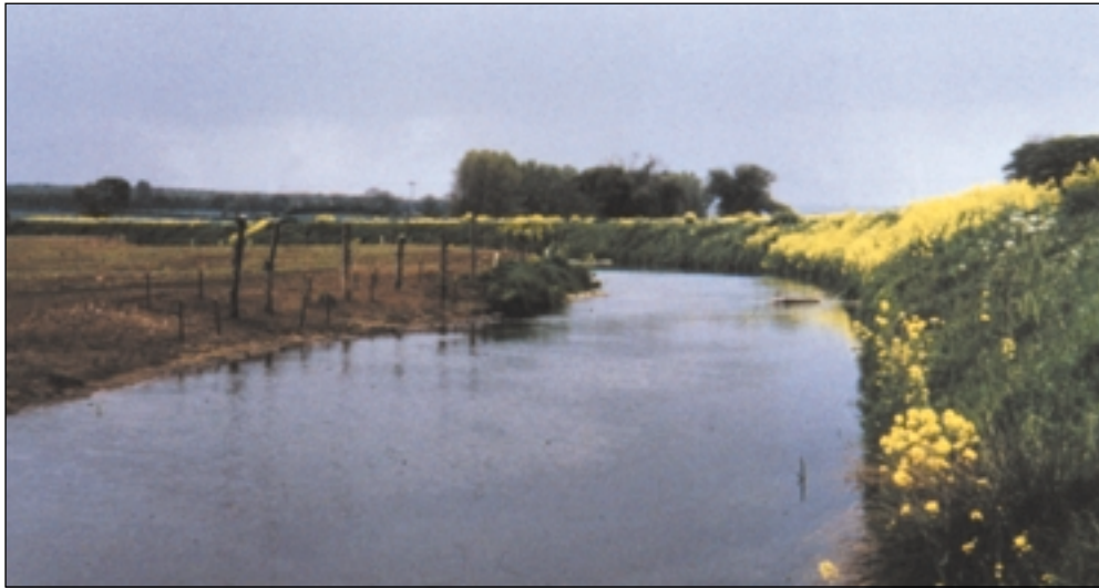
Removal of the left floodbank and marginal berm creation on the Great Eau at Withern