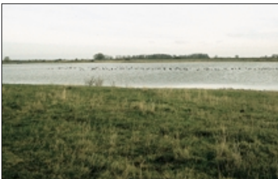
View from the new embankment across the restored floodplain. Showing wintering wildfowl, January 1999

Water is designed to spill onto the 16ha site from the Long Eau when levels reach 2.6m above OD, just 0.3m over their normal retained level. This floods progressively outwards from the old course of the IDB drain, which represents the lowest levels within the area. This low spot remains damp for much of the year, the downstream end forming a permanent wet scrape/shallow pool.