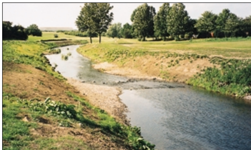
Stone Riffle downstream of Hutton Avenue footbridge

The riffle is configured as two semi-elliptical shoals, diagonally opposite each other, that are linked by a shallow sloping weir, such that the whole is a single, homogeneous structure. During low flows, only the weir is submerged but the shoals quickly drown as flows increase. The configuration sustains a deep,