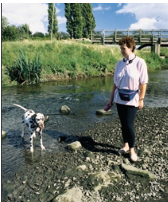
The riffle allows easy access down to the river – November 1996

Of particular note is the popularity of this spot with children who can gain safe access to the river and paddle in the shallow water, where the bed is firm and stoney.