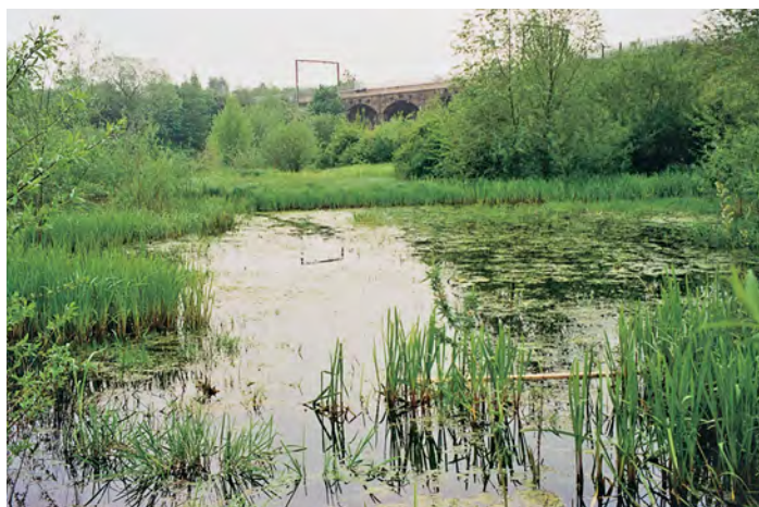
Comparative view of Rockwell scrape after work completed

Some piles were cleared from site and the ground taken down to expose historic floodplain soils, although these were found to be interspersed with deposits of dumped foundry sand. These sands were also evident throughout the restored floodplain, marking Darlington's industrial history of iron works.