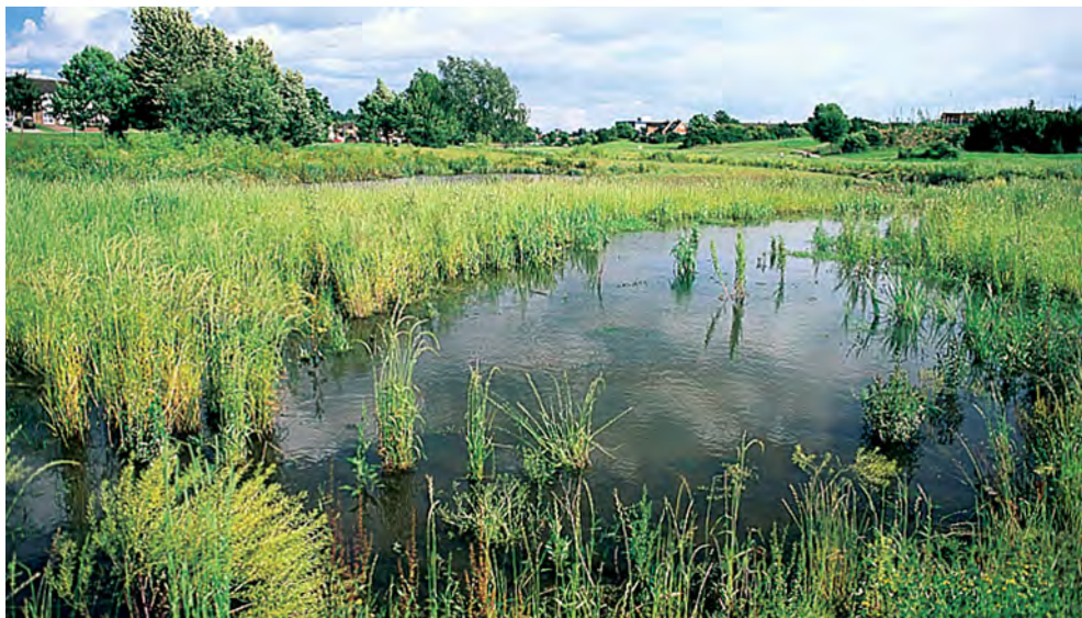
Completed spring-fed scrape