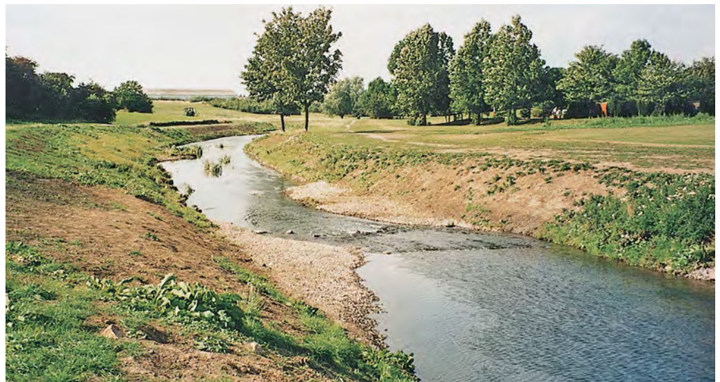
Stone Riffle downstream of Hutton Avenue footbridge

Firstly, the sight and sound of water cascading over the riffle is enjoyed by people using the footbridge. Also, the regulation of normal water levels upstream has helped in introducing stable marginal planting ledges where water birds and mammals can always be seen. Two surface water outfall pipes just upstream (one 900mm diameter) are always submerged because of the riffle (see Technique 9.1 ). Children regularly paddle in the shallow flow over the riffle. In anticipation of this the design needed to be as intrinsically safe as possible.