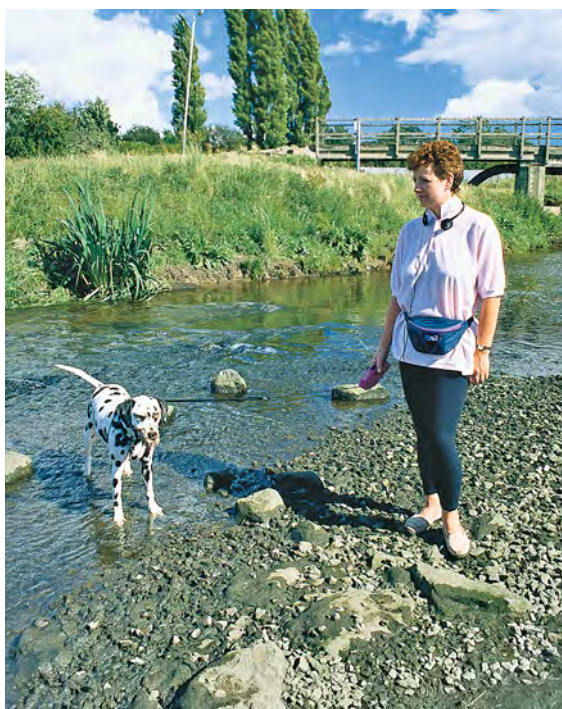
The riffle allows easy access down to the river – November 1996

The stone used for construction was a densely graded crushed rock mixture sized 300mm down to 5mm. The dominant size (at least 50%) was in the range 125-300mm to ensure that the structure would not wash away during floods, albeit some adjustment to form would inevitably occur. As a final measure, the entire structure was covered in a layer of smaller crushed stone to simulate gravel. This mixture was sized 75mm down. Its purpose was to smooth out the irregularities in the core rock surfaces improving appearance. Much of this material would be washed away by floods, but was expected to settle out in desirable niches close downstream.